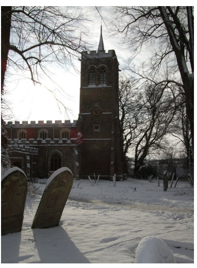
Gt Gransden - Jan 2013