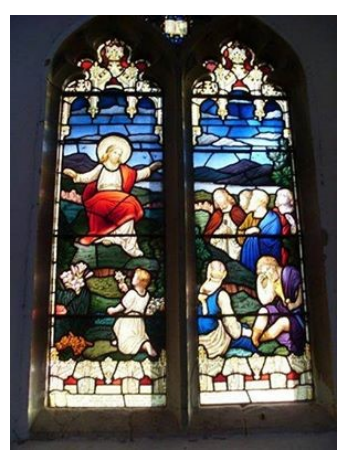
Window in Lt Gransden Church

Further information on all aspects of the parish's finances will be given in the statement of accounts for 2015 which is being issued separately at the Annual General Meeting.